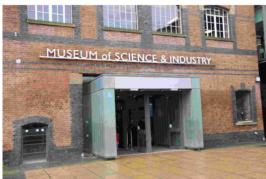
Museum of Science and Industry, Manchester

We were proud to exhibit the Lottery-funded Lunt LS80PT solar telescope although inclement weather prevented its live views of the solar disc.